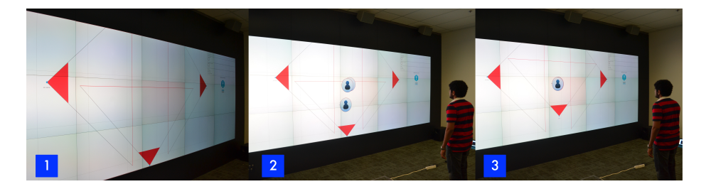
Fig. 3. Calibration. (1) Manually align the Kinects to overlap (2) A user stands in the overlapping area (3) Calibrate button is clicked on MSE Visualizer to calibrate the Kinects