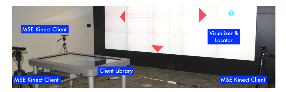
Fig. 1. MSE Architecture. Example environment with multiple MSE Kinect clients running, a tabletop running a client library and the MSE Visualizer and Locator service running on a wall display

MSE-API is designed to integrate much of the prior and sometimes independent work in the literature – proxemics and spatial interactions, multiple sensor approaches – into a useable API for developers to build multi-surface environments and applications without worrying about low-level details such as spatial tracking. Specifically, MSE-API is useful for use cases involving spatial queries and device-to-device communication. In this section, we describe the main components of MSE-API, as well as multi-Kinect integration and calibrating the room environment.